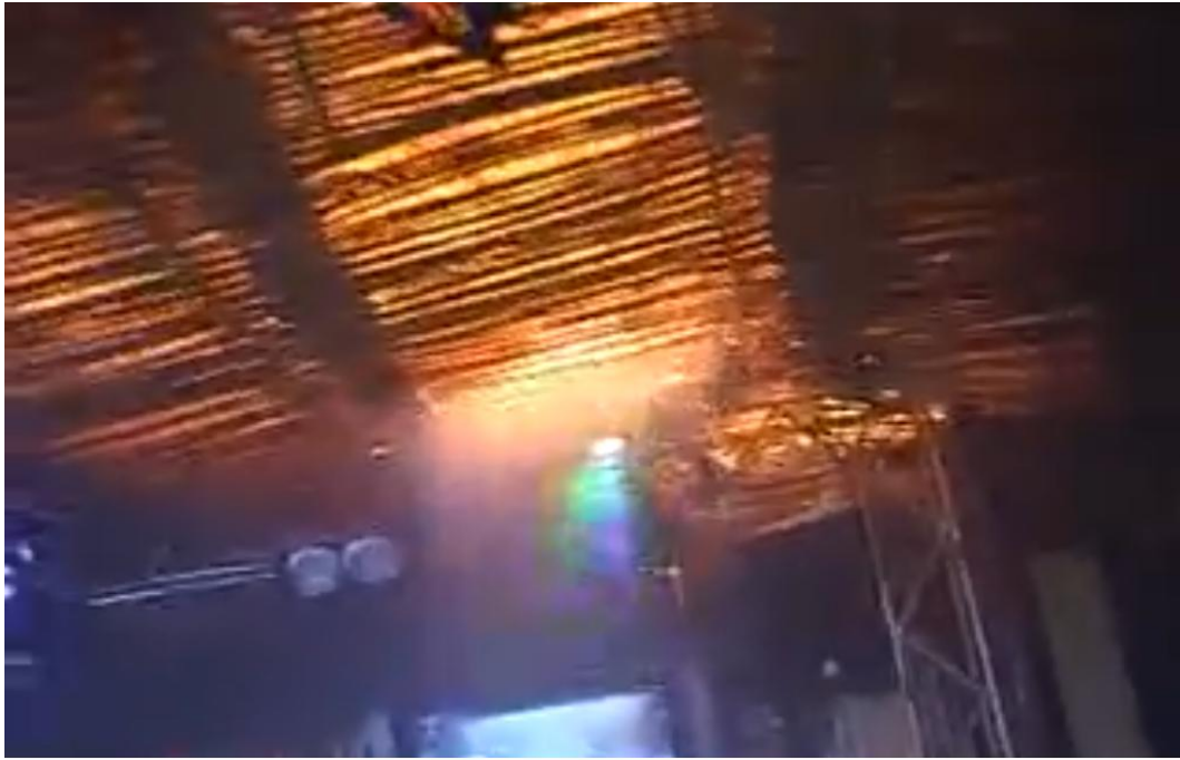
Image 4: Burning ceiling in the Lame Horse Club