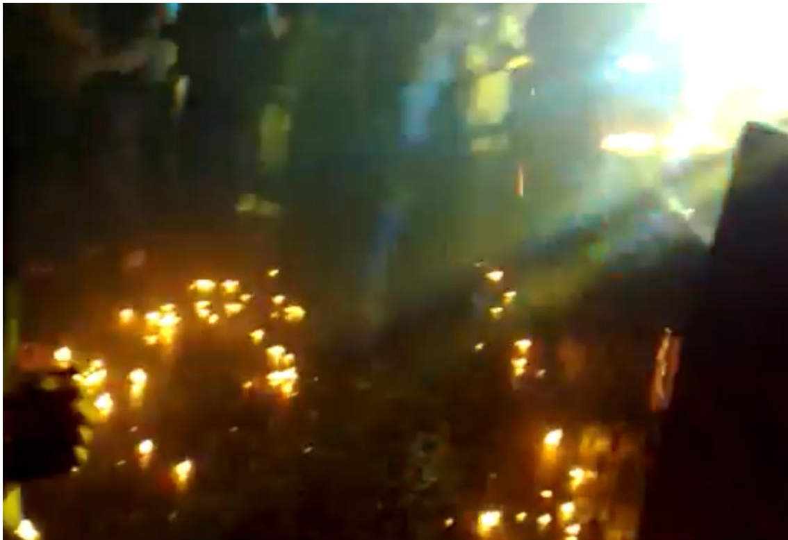
Image 8: Burning debris in the Luna nightclub

The fire began when the ceiling materials were ignited by a pyrotechnical device. The choice of materials however did not allow a rapid spread of fire and smoke. The instructions of the staff helped to get every occupant out.